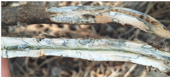
Figure 1. Split soybean stem or scrape away outside layer to show “zone lines” caused by Diaporthe fungi

Zone lines associated with Diaporthe species appear on the inside of lower soybean stems and roots when split longitudinally, or if the outside layer of the stem is scraped away (Fig. 1). Lines are thin and dark, appearing in irregular patterns and small circular shapes in mature soybean plants.