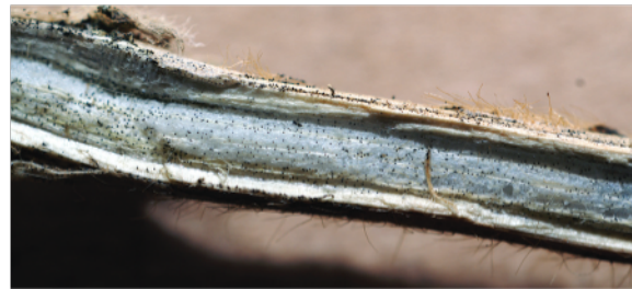
Figure 2. Microsclerotia within and on the surface of soybean stem or root tissue

Signs of charcoal rot are tiny, dark survival structures called microsclerotia within and on the surface of the lower stem and taproot. Microsclerotia cause light gray discoloration or a charcoal-like appearance of these plant parts (Fig. 2).