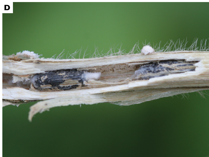
(A) Susceptible flowering soybean variety, (B) apothecia of Sclerotinia sclerotiorum which produce ascospores, (C) signs of S. sclerotiorum include white tufts of mycelium and sclerotia produced in and outside stem tissue, and (D) sclerotia of S. sclerotiorum inside a soybean stem.