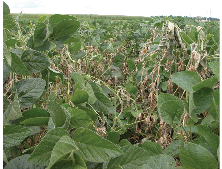
Symptoms of white mold include wilting, lodging, and plant death.

Yield loss is more severe when plants die prematurely or stems are girdled. In addition to causing yield loss, white mold can impact seed quality and reduce grain price because of foreign material at the elevator if sclerotia are present. After harvest, check seed lots for sclerotia and infected seeds. Infected seeds are usually smaller; lighter; white, and cottony.