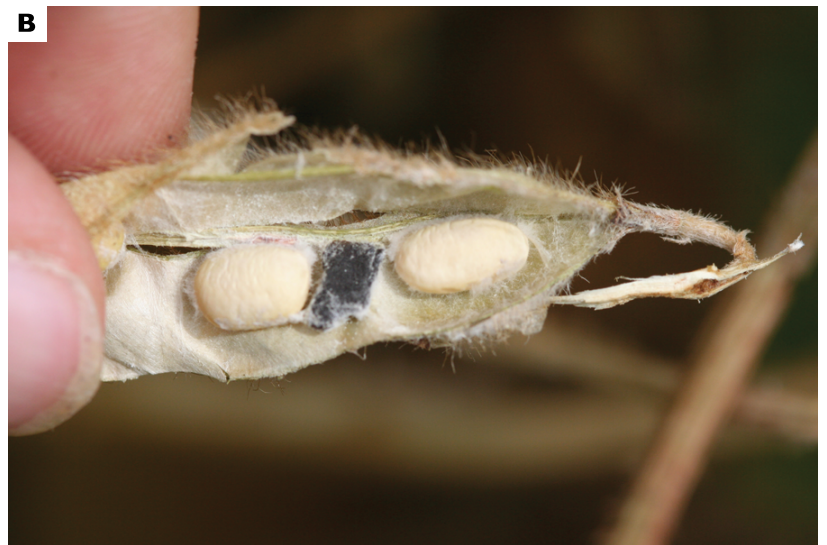
(A) Sclerotia of Sclerotinia sclerotiorum in harvested grain and (B) infected seed with a sclerotium in a pod.