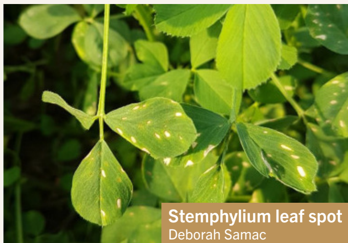
Stemphylium leaf spot