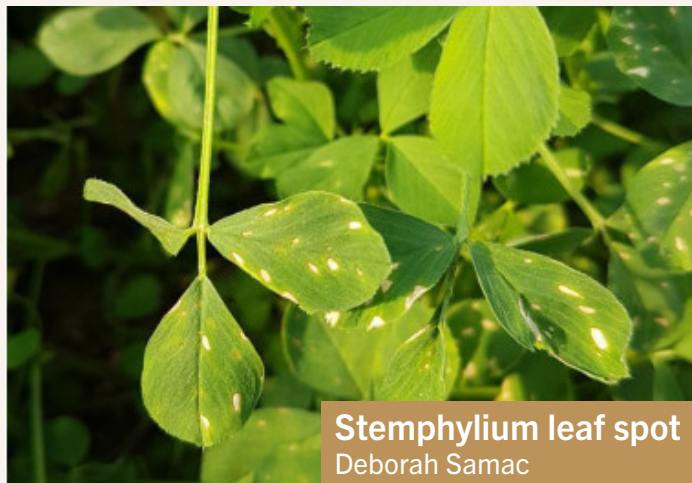
Stemphylium leaf spot